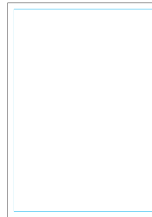
Margins 2 x L all round e.g. 8mm for A4

4 x L left and right – up to 6 columns with 5mm gutters